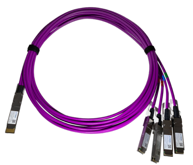
1:4 Breakout SHIFT AEC